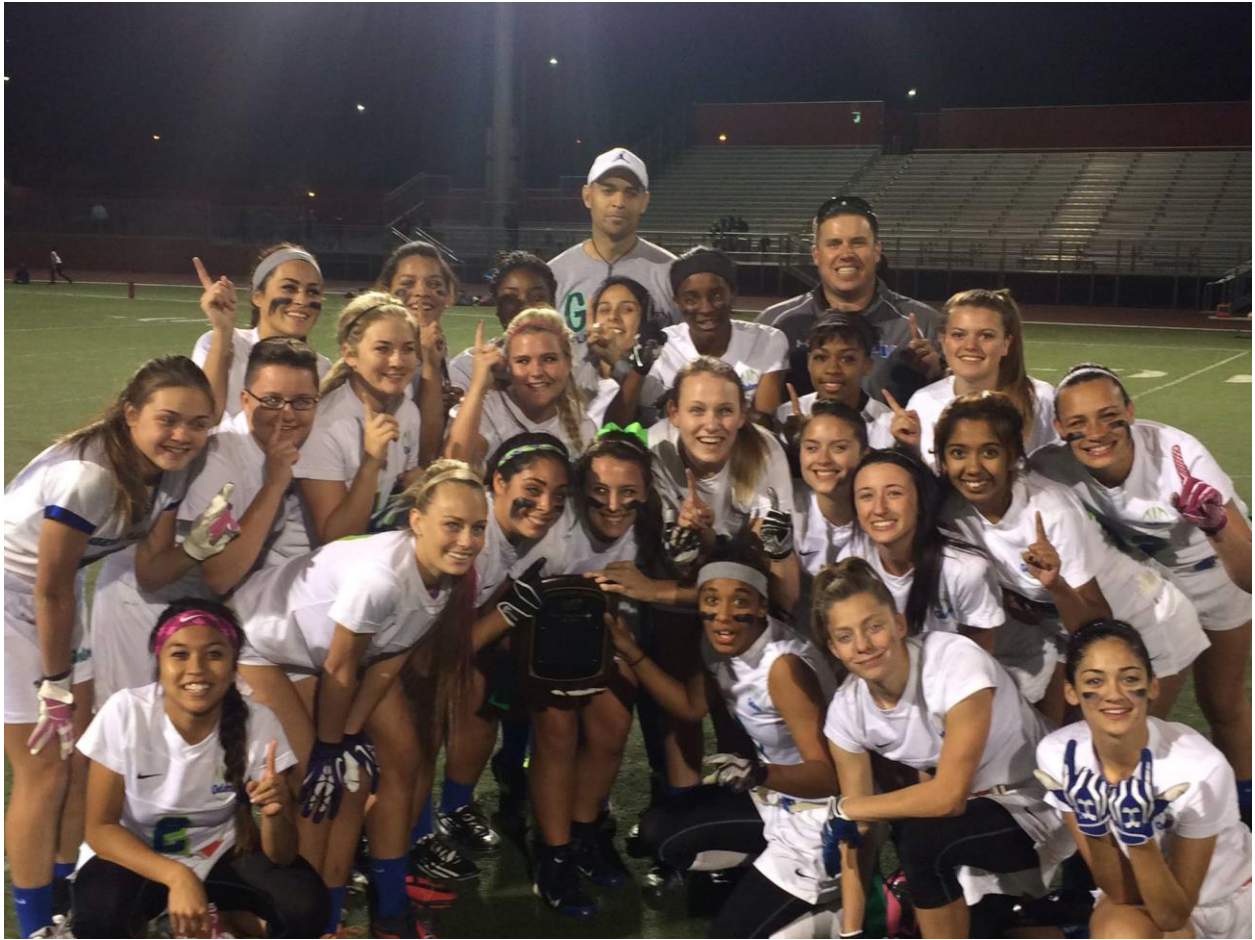
Photo 1: Green Valley High School Girls Flag Football Team 2014 Sunrise Region Champions.